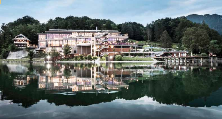
SAUNA WITH A VIEW: HERZOGSTAND SAUNA

ZIRBEN-SAUNA (around 75° C) Aromatic stone pine wood fills the air with a soothing scent, especially during the Aufguss. Pine wood is antimicrobial and highly aromatic, contributing to a strong feeling of well-being.